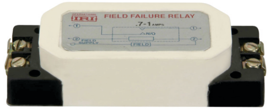
Field Failure Relay