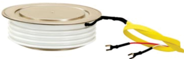
DCR (Phase Control Thyristors)