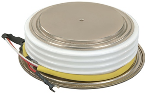
Power Diode (Capsule Type)